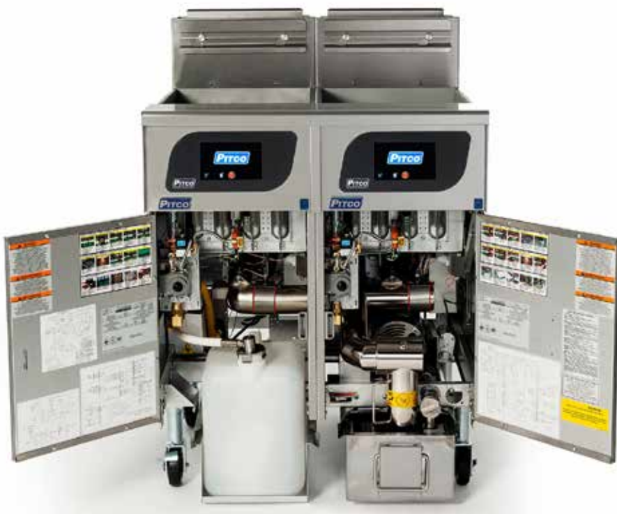
SSHLV14-2 w/ optional Infinity Touch™ Controls